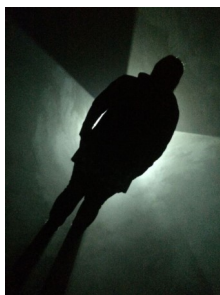
The women who brought the light Category 2: photo by secondary school age students