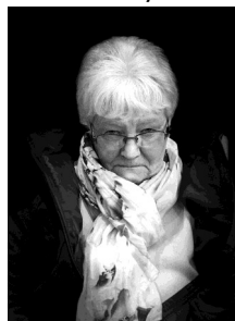
Grandma Category 3: photo by primary school age children