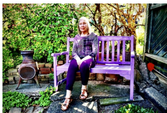
A moment to relax, in green and purple Category 1: photo by adults

Almost 600 votes were cast on the shortlisted entries and the winners were announced at St Columba's on 4 th July and the prizes awarded at the Summer Fayre on Saturday 7 th July.