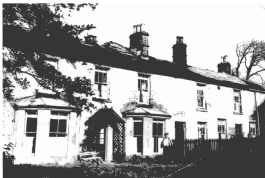
Low Ash Farm, Stubbing Lane, Worrall, Nr. Sheffield

One of the nearest places to Crosspool which had a definite link to 'The Great Sheffield Flood', the 150th anniversary of which will be marked at Bradfield in early March with events, exhibitions and a special service at the beautiful hilltop church of St. Nicholas, was Low Ash Farm at Stubbing, situated twixt Loxley and Worrall. Dating from the mid 1600's, the place has been altered from time to time including major structural work a few years ago, for a period of some fifty years from the early 1830's, it was also in part, used as a Boys' Boarding school, to which, for their education, lads came from all parts of England.